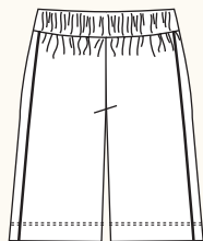
B - BACK

DESCRIPTION: Casual, semi-fitted lounge pants feature contrast piping and vertical seaming, faux-fly detail for a modern look. Elastic waistline also has a fabric tie belt to customize the fit. Rise is cut slightly lower in the front and higher in the back. View A pants are full length. View B shorts are knee length.