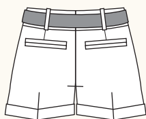
B - BACK

DESCRIPTION: Fitted trousers and shorts feature front fly closure, slash front pockets and a back extension for easy alteration. Trousers and shorts sit below natural waistline with contoured waistband. View A trousers are slightly flared. View B shorts can be worn cuffed or straight, with an optional grosgrain ribbon belt.