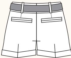
B - BACK

DESCRIPTION: Fitted trousers and shorts feature front fly closure, slash front pockets and a back extension for easy alteration. Trousers and shorts sit below natural waistline with contoured waistband. View A trousers are slightly flared. View B shorts can be worn cuffed or straight, with an optional grosgrain ribbon belt.